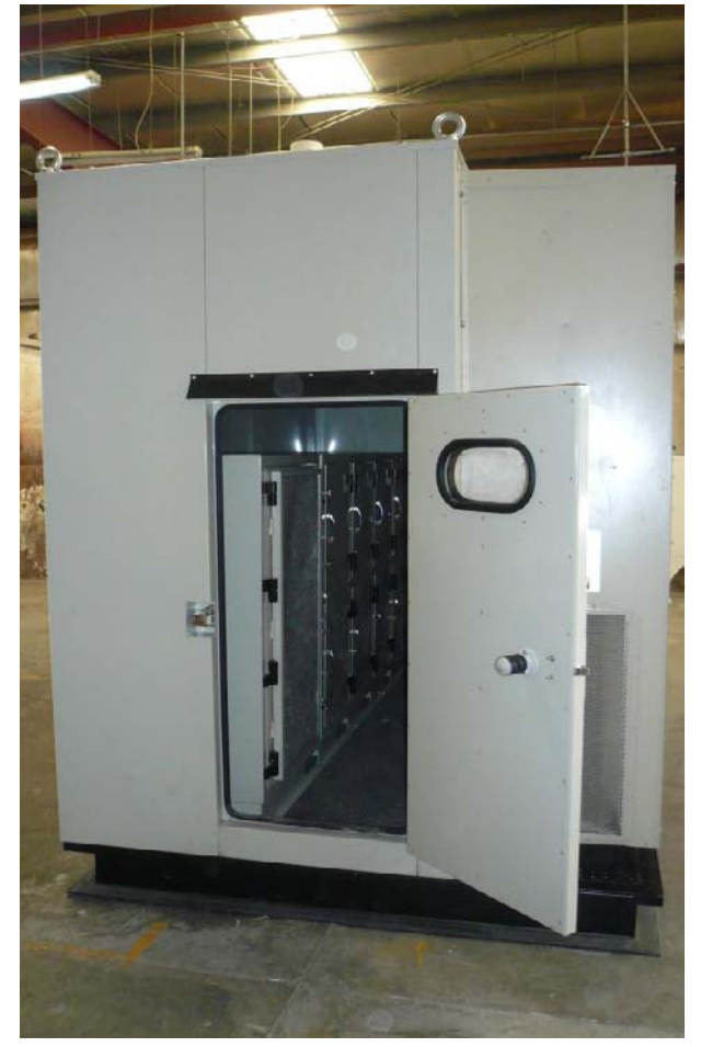
Available from Bio-Oxygen Middle East, Dubai